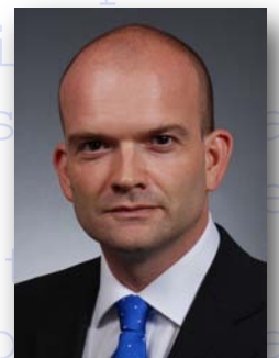
Richard Hester Middle School Principal